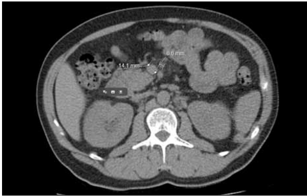
FIGURE 2 Mesenteric lymphadenopathy (arrow) can be seen in the upper abdomen with nodes measuring up to 8 mm in short axis. No hydronephrosis was found and there were no renal, ureteric or bladder calculi.

would have the same pathology. Histological features were consistent with a diagnosis of chronic sclerosing sialadenitis (Küttner's tumour). Immunohistochemical staining was not performed on the salivary biopsy. The patient was treated with conservative management and reviewed twice yearly by the maxillo-facial team.