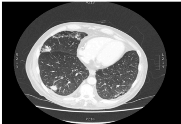
Figure 1 Computerised Tomography (CT) cross-sectional image of the bases of both lungs demonstrating multifocal consolidation

initially reluctant to attend hospital again so the hospital community team visited him at home and after two days he was persuaded to be re-admitted.